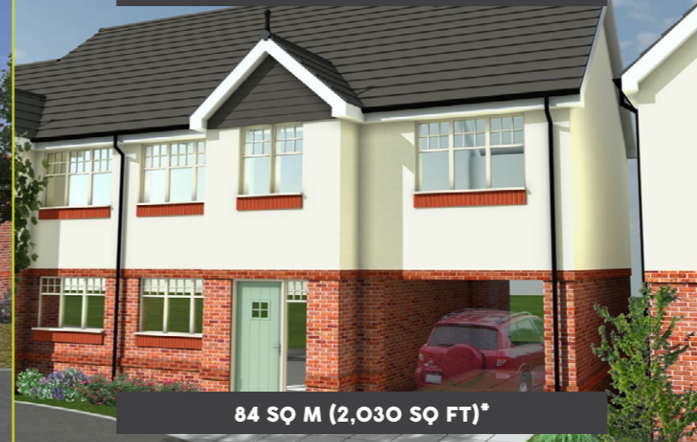
THE FENTON 3 bed, semi-detached house