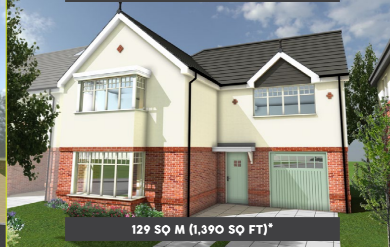
THE BADMINTON 4 bed, detached house