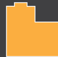
THE BADMINTON 4 bed, detached house