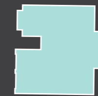
THE LOWTHER 4 bed, detached house