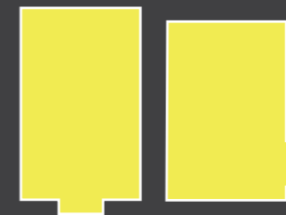
THE HARROW 3 bed, detached house