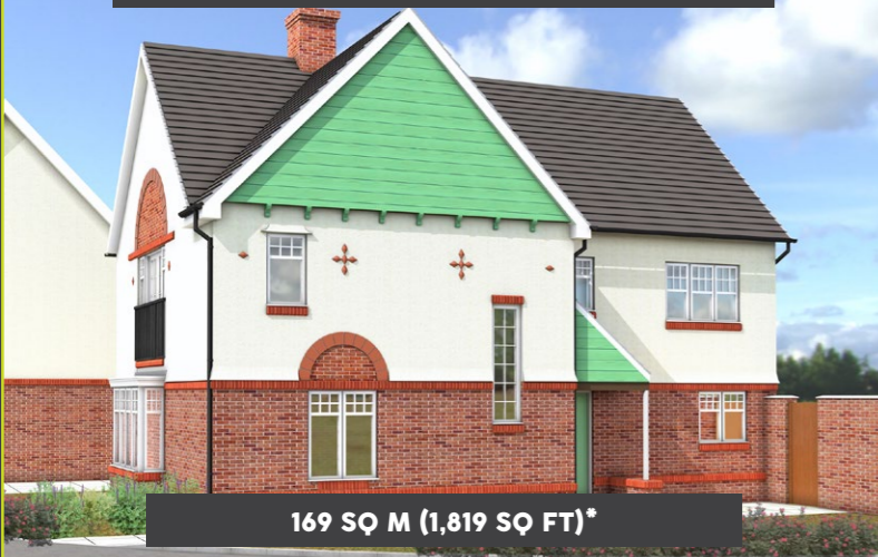
THE SANDRINGHAM 4 bed, detached house