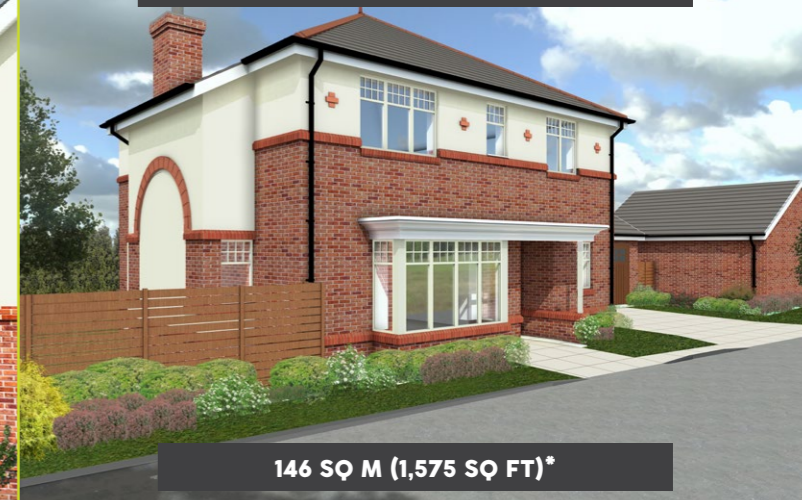
THE WHITEHALL 4 bed, detached house