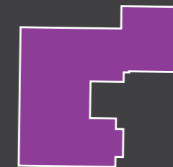
THE WINDSOR 5 bed, detached house