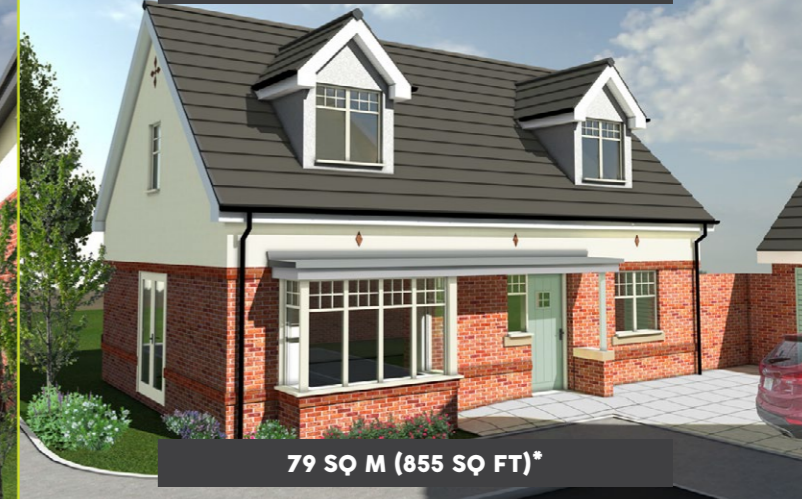
THE HARROW 3 bed, detached house