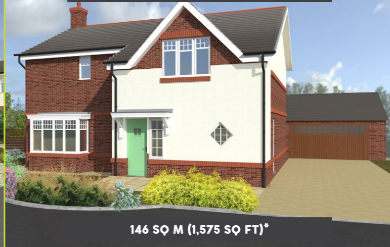
THE BALMORAL 4 bed, detached house