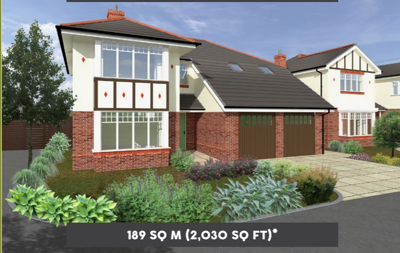
THE LOWTHER 4 bed, detached house