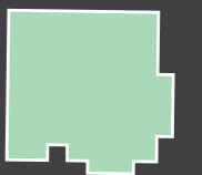
THE WHITEHALL 4 bed, detached house

Further information is available on request through the Wrea Green data room.