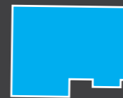
THE BALMORAL 4 bed, detached house