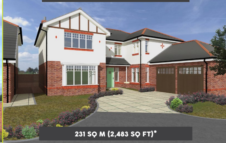
THE WINDSOR 5 bed, detached house