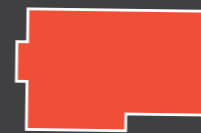
THE SANDRINGHAM 4 bed, detached house