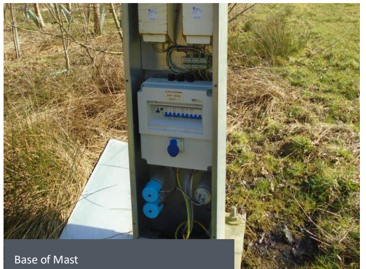
Base of Mast