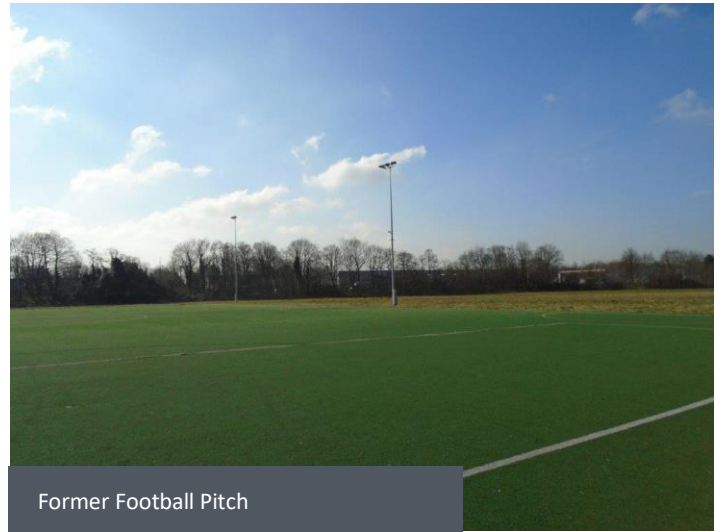
Former Football Pitch