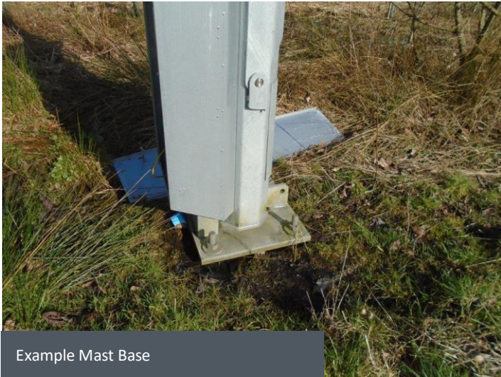
Example Mast Base