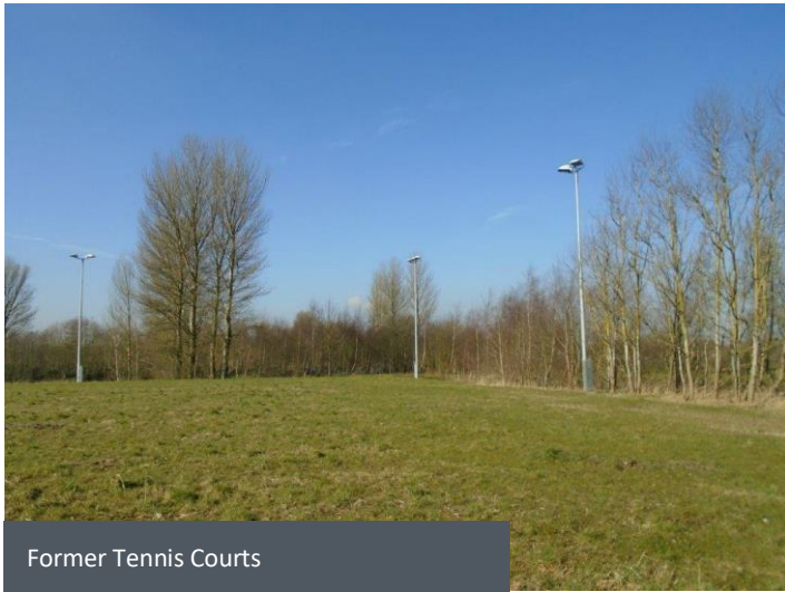
Former Tennis Courts