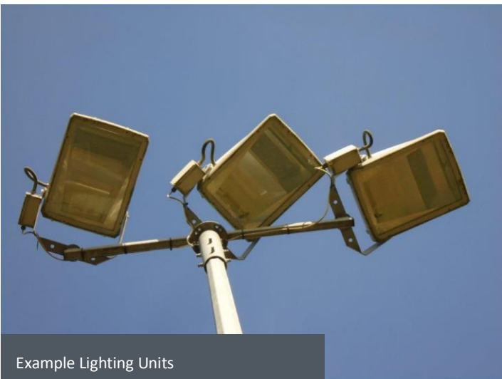
Example Lighting Units