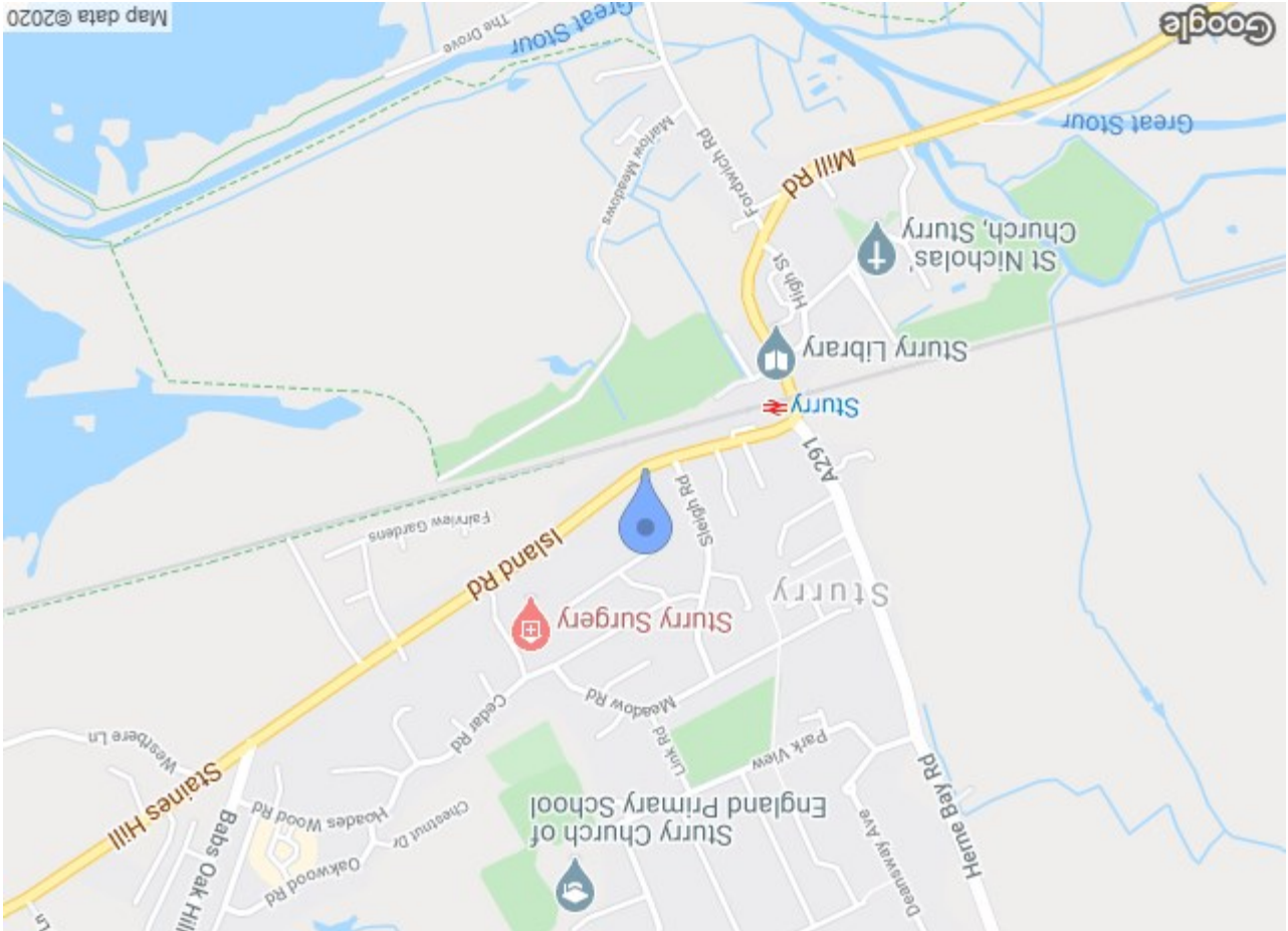
FLAT 1-7 SYLVADALE MEWS 36 ISLAND ROAD CANTERBURY