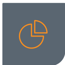
Service Charge Consultancy