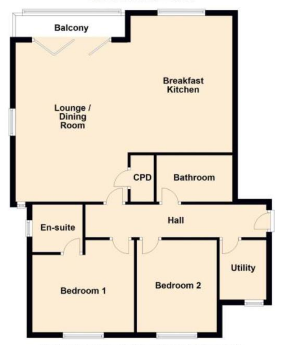
First Floor Approx. 87.5 sq. metres (941.7 sq. feet)