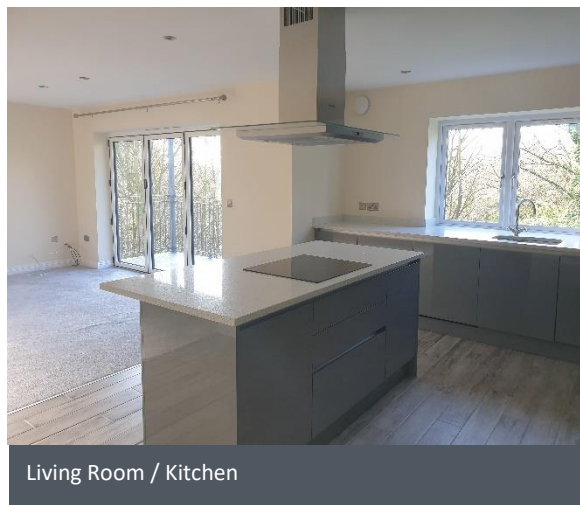
Living Room / Kitchen