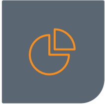
Service Charge Consultancy