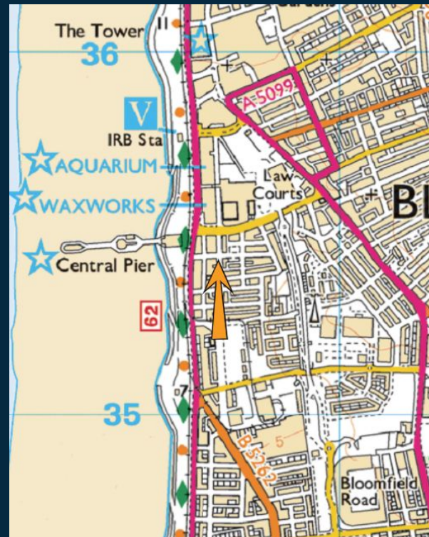
Land at Jaggy Thistle and Land at York Street, Blackpool, FY1 5AQ

The car parks are circa 3 miles from the M55 motorway.