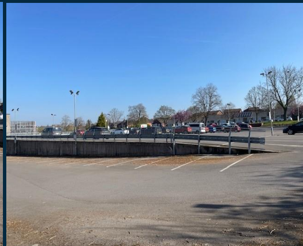
Car park at Hilton Street, Stoke on Trent, ST4 6RR